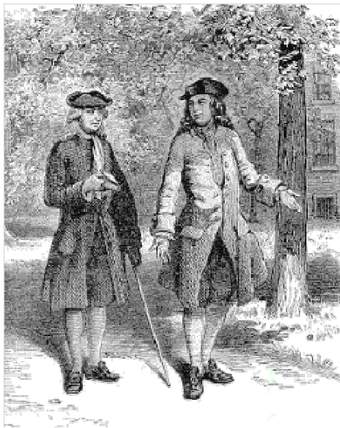
John Wesley and Count Zinzendorf at Herrnhut.

We witnessed true convergence of Christian worship and faith, in this community of teachable, pliable, humble and effective Christians devoted to missionary work.