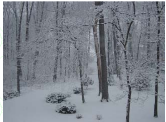
Photo of a snowy wood

skeptical, materialistic world that Jesus’ existence and claims (and those made about Him by his disciples and followers) have a basis in the same type of record as the existence and claims of Julius Caesar or Socrates. But I must say that this approach to Christianity would never have moved me when I was still lost in my sin.