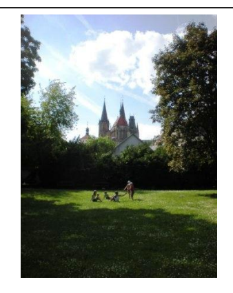
Monastery in Kolin, CR