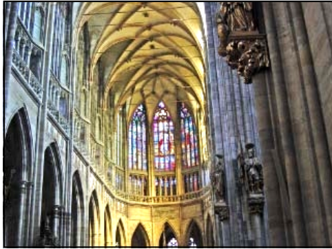
St. Vitus Cathedral, Prague