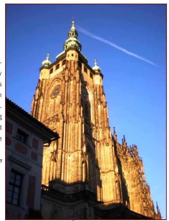
St Vitus Cathedral at Hradcany