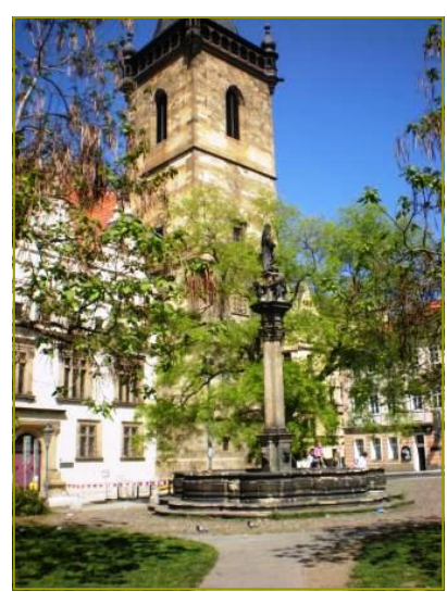
New Town Hall at Karlovo namesti

When the New Town of Prague was built 700 years ago, it was meant to serve as Prague's main commercial district. And that is how it can still be characterized today. Numerous businesses, hotels and banks are located there, as well as department stores, boutiques and a few small shopping malls. The New Town is also rich with culture, offering many theatres, movie theatres, museums, and an opera house.