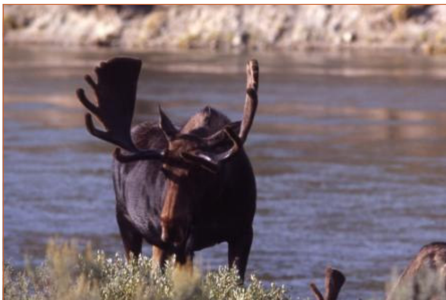
Moose in Yellowstone National Park

As the participants will have several options as to all the logistical arrangements, each person will cover his or her own expenses for the transportation and accommodation arrangements he or she chooses, including airfare to and