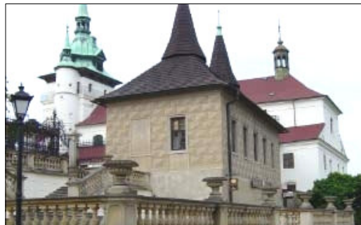
Teplice architecture