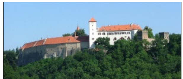
Castle of Bitov