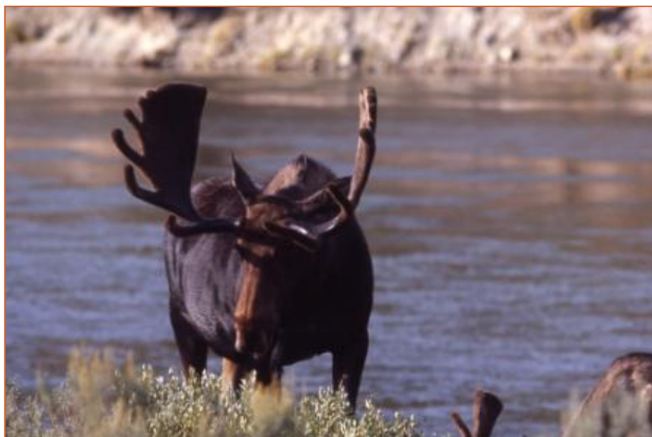
Moose in Yellowstone National Park

As the participants will have several options as to all the logistical arrangements, each person will cover his or her own expenses for the transportation and accommodation arrangements he or she chooses, including airfare to and