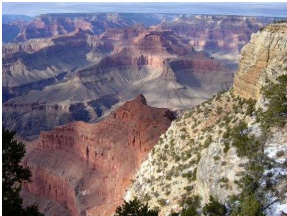
The Grand Canyon