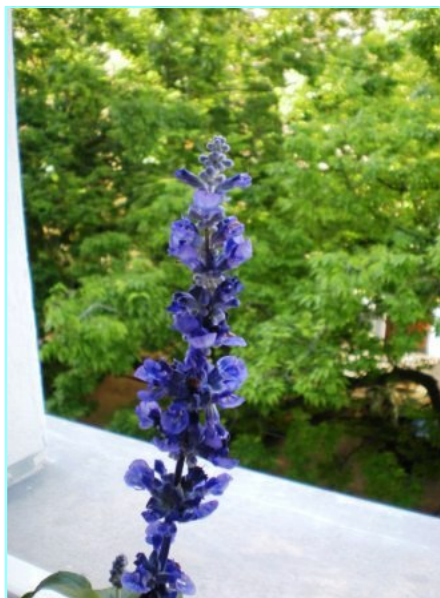
ILI's new home in Prague

The next "Anti-Stress program in Florida" will be offered in October -November 2010; a "Jewels of the American West" program will be offered in May 2011.